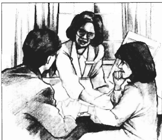
The doctor will ask about medical history.

To diagnose diverticular disease, the doctor asks about medical history, does a physical exam, and may perform one or more diagnostic tests. Because most people do not have symptoms, diverticulosis is often found through tests ordered for another ailment.